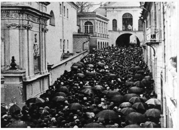
The "Dawn Gate" to the city of Vilnius. Here the image of The Divine Mercy was seen for the first time by the public during celebrations marking the close of the Jubilee Year of the Redemption of the World, April 26-28, 1935.

The year was 1935. The place was Vilnius, or Vilno, a city in northern Poland at the time, Lithuania today. It was the weekend after Easter, and the Image was displayed over a crowd celebrating the conclusion of the Jubilee of the Redemption.